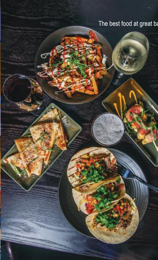
The best food at great bar prices.