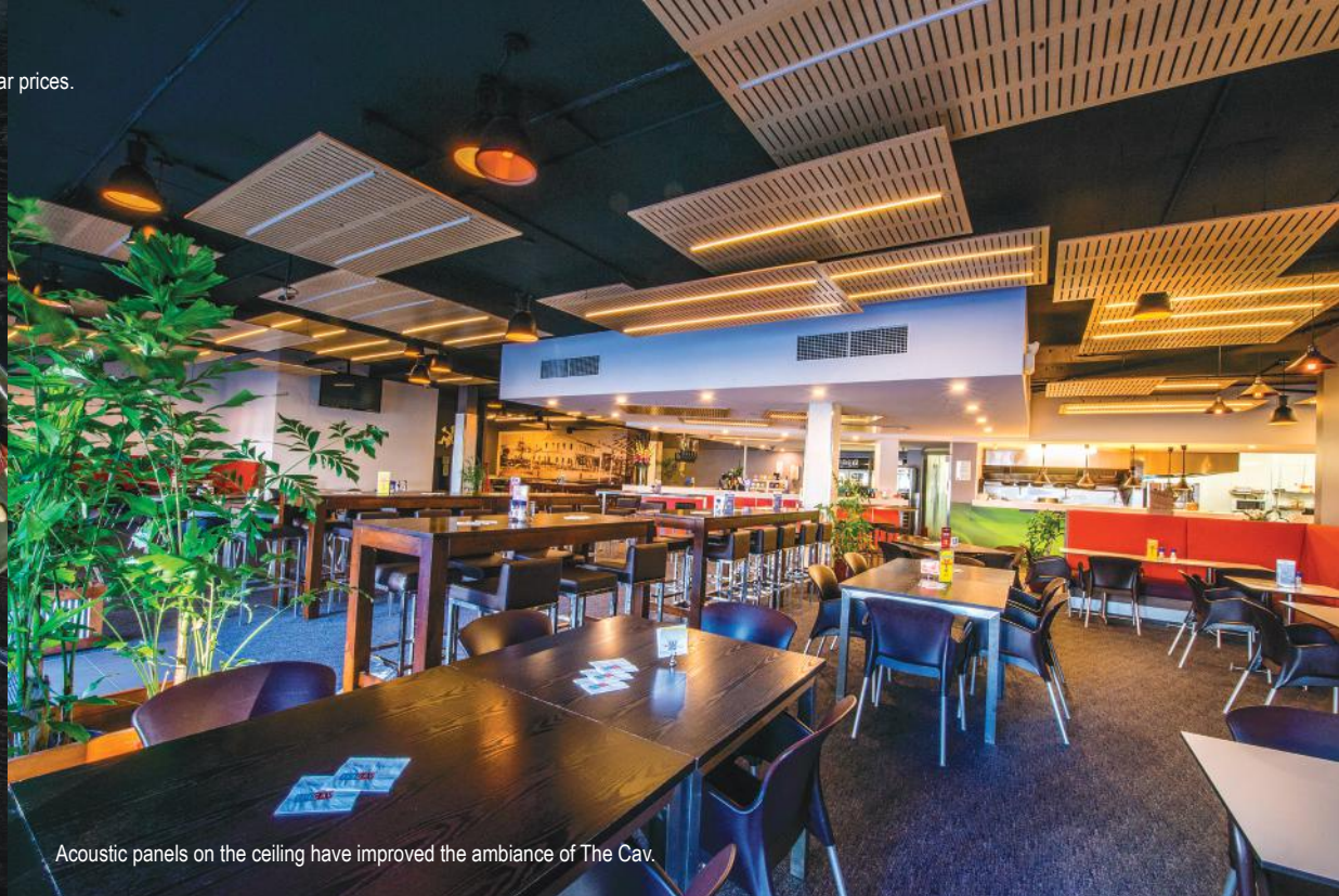
Acoustic panels on the ceiling have improved the ambiance of The Cav.