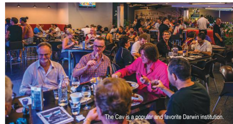
The Cav is a popular and favorite Darwin institution.

Check out the great meal deals every week at this Darwin favourite - The Cav