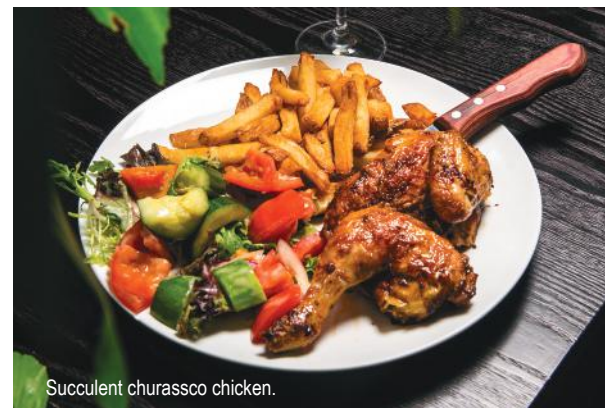
Succulent churrasco chicken.