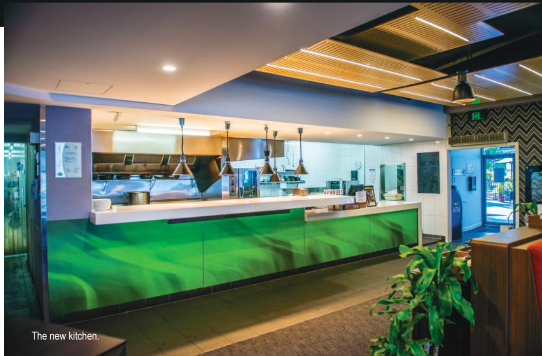
The new kitchen.

When a Darwin institution gets a facelift, everyone has an opinion. But no one could find fault with the new-look Cav. From the acoustic improvements inside to what everyone longed for—a full bar outside—what was already a great spot to enjoy some of the best food in town is now a must-visit.