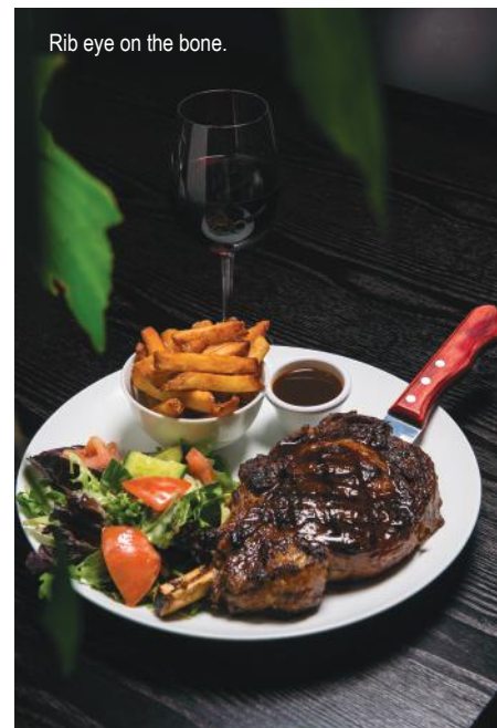
Rib eye on the bone.