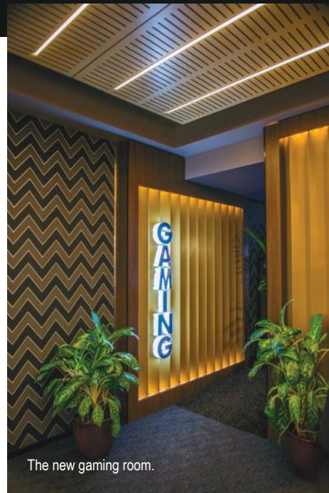
The new gaming room.