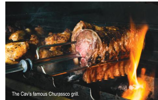
The Cav's famous Churrasco grill.