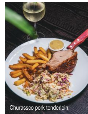
Churrasco pork tenderloin.